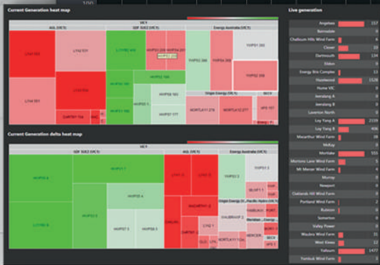
This example show Live Generation in a heat map using external data-driven elements.