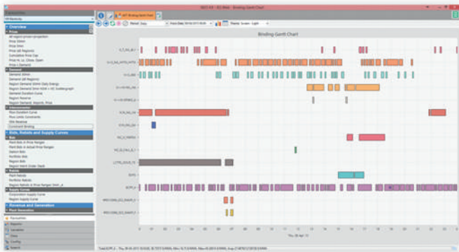
Running a report from favourites in NEOexpress

NEOexpress is also a great option for NEO users. With a NEOexpress account you can access your own data and reports plus ours! It also gives you access to our library of 1000's of reports which as a current licensee you are free to copy to your own servers.