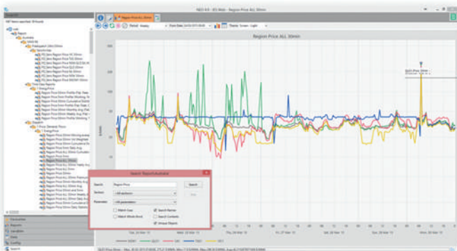
Search results for reports name containing 'Region Price' in NEOexpress